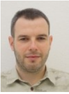
M. Tallián Semilab, Budapest, Hungary