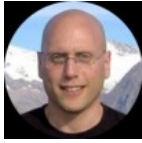
I. Englard Applied Materials Israel (AMIL), Rehovot, Israel