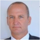
E. Shekel Tokyo Electron Limited, Hadera, Israel