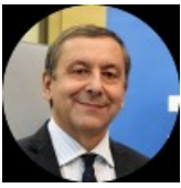
F. Profumo President National Research Council (CNR), Rome, Italy