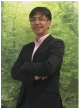
Y. Yamazaki ULVAC, Munich, Germany