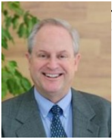
J. Jackman Semi, Milpitas, United States