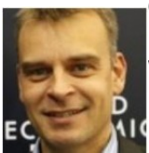
O. Schwab Managing Director World Economic Forum, Geneva, Switzerland