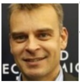
O. Schwab Managing Director World Economic Forum, Geneva, Switzerland