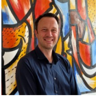
A. Stur Texas Instruments, Munich, Germany