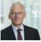
F. van Houten CEO Royal Philips, Amsterdam, The Netherlands