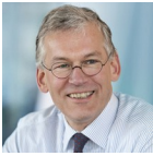
F. van Houten CEO Royal Philips, Amsterdam, The Netherlands