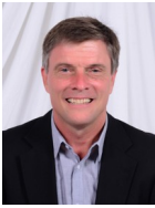
J. Behnke GM Final Phase Systems INFICON, East Syracuse NY, United States